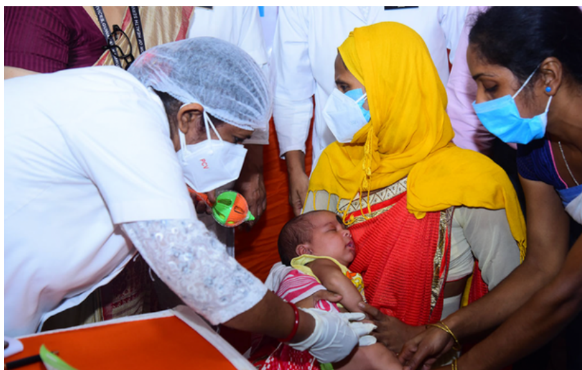
Photo: PCV introduction in India

Share: #Vaccines4Life #EveryBreathCounts