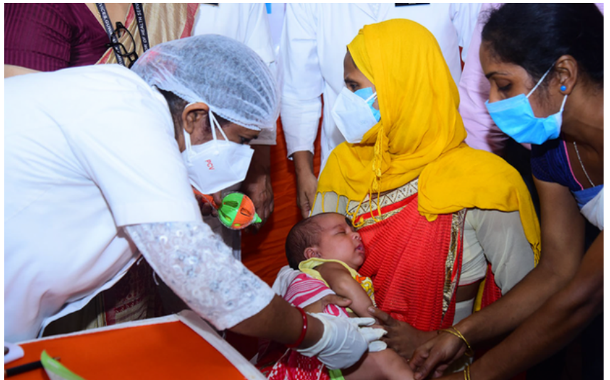
Photo: PCV introduction in India, JSI, 2021

Share: #Vaccines4Life #EveryBreathCounts